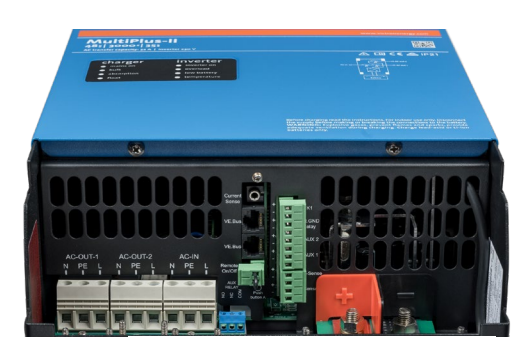
Connection Area MultiPlus-II 3k